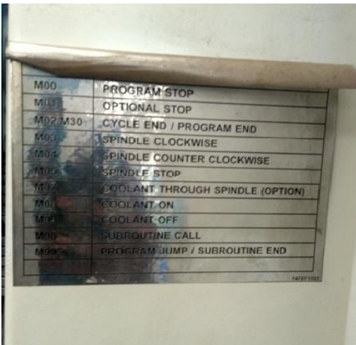
Figure 2. FANUC Controller

For Tool selection there's different types of cutter available in market such as Side Face Cutter, End Mill, Insert Edge Cutters etc. To Carry out these experiments Insert Edge cutter of 50mm diameter was selected according to the requirement of the cutting size with the considerations of Industrial use.