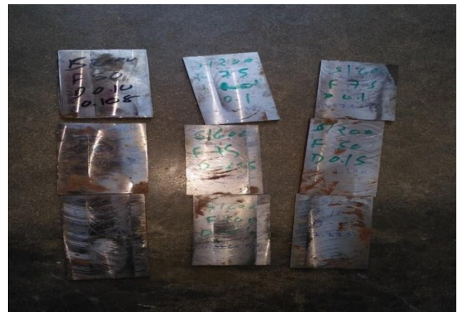
Figure 5. Trail Experiments

The Experiments were designed according to Taguchi's Design of Experiments under the selection of three levels of three factors chosen which were Spindle Speed, Feed Rate and Depth of Cut and The Roughness tests were concluded after measuring through the Mitutoyo Roughness tester (Fig 4) recorded in Table 2 and also the experiments are conducted for partial factorial design [7]. Figure 5 contains few selected experimental plates on which the experiments were carried out.