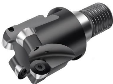
Figure 3. Insert Cutter

For Tool selection there's different types of cutter available in market such as Side Face Cutter, End Mill, Insert Edge Cutters etc. To Carry out these experiments Insert Edge cutter of 50mm diameter was selected according to the requirement of the cutting size with the considerations of Industrial use.