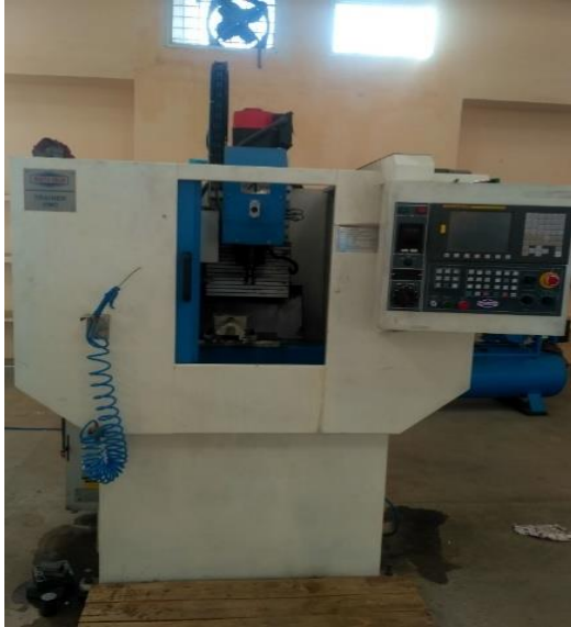
Figure 1. Baltiboi VMC